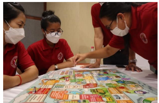
Playing “Sugoroku” with fun and learn about SDGs at the same time. It is designed for both of adult and student.