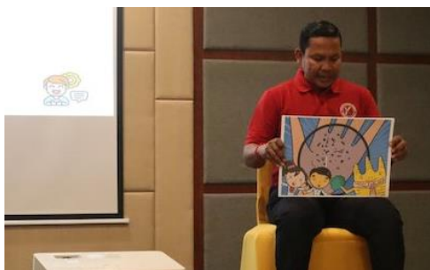
Demonstration by “Kamishibai” specialist who invited from publish company uses several kinds of voices when he reads the script.

The advantage of using “Kamishibai” is that children as well as teachers can acquire knowledge. It is a teaching material that can be used in the classroom without prior knowledge of Health education. It can be called “teaching and learning material”