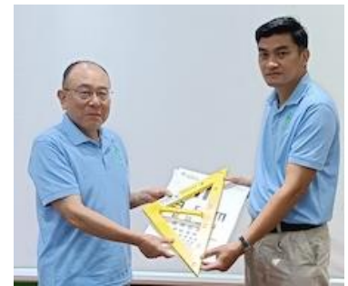
Health Check-up materials